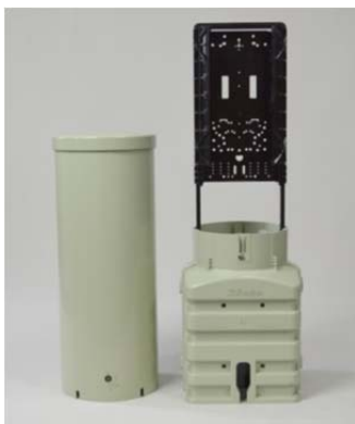
Front View Terminal Block Mounting Side (Deep Side of Fiber Organizer)

http://www.charlesindustries.com/download/Fiber_Pedestal_in_PDF/Fiber_Pedestals_Downloads.html