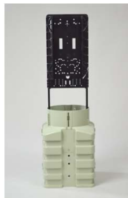
Rear View (Shallow Side of Fiber Organizer)