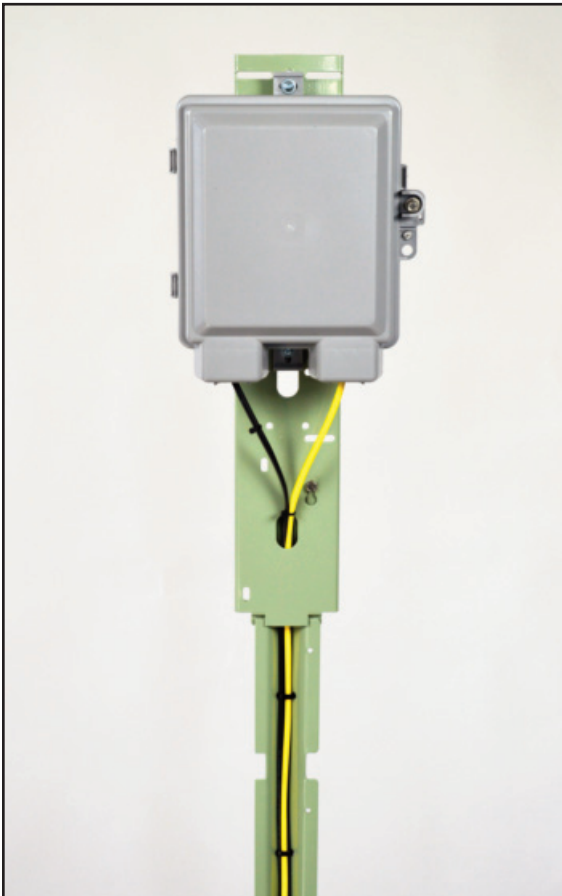
AMHP-1 shown with mounted NID