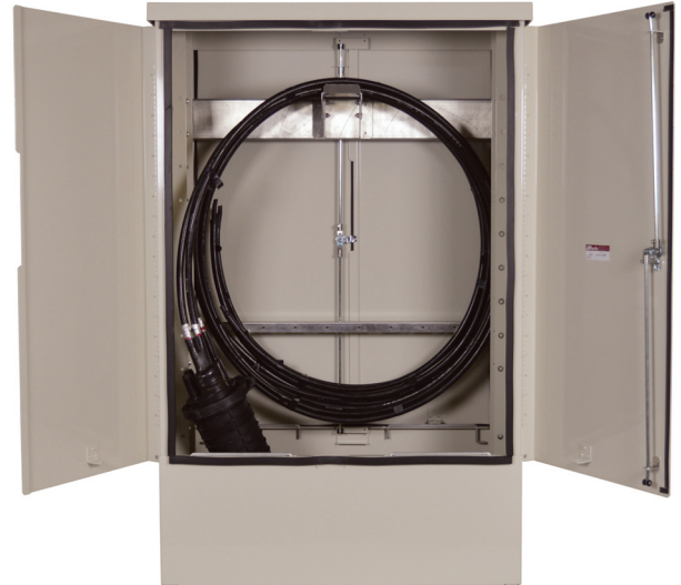
CSE Fiber Configuration

Charles Splice Enclosure (CSE) Series provides affordable metallic enclosure solutions for housing a variety of equipment. Designed for storing copper splices (6,000 pairs to 10,000 pairs) or sealed fiber splice enclosures with cable slack storage, CSE offer a useful combination of superior environmental protection, ease of installation, and generous internal volume.