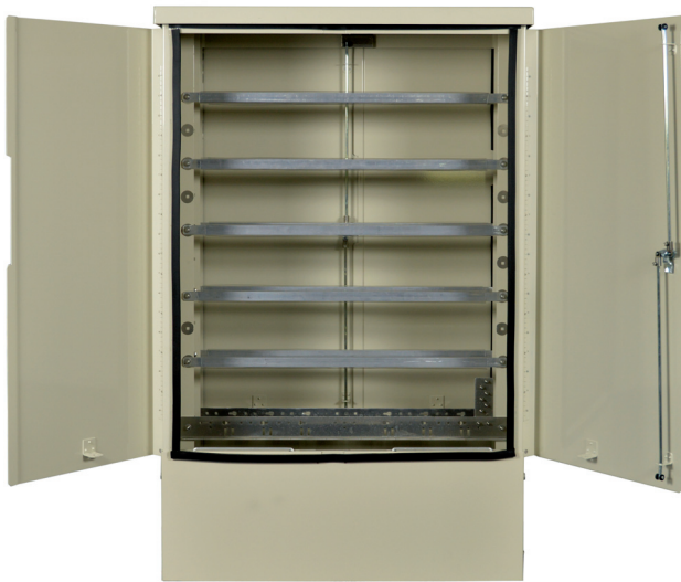
CSE Copper Configuration