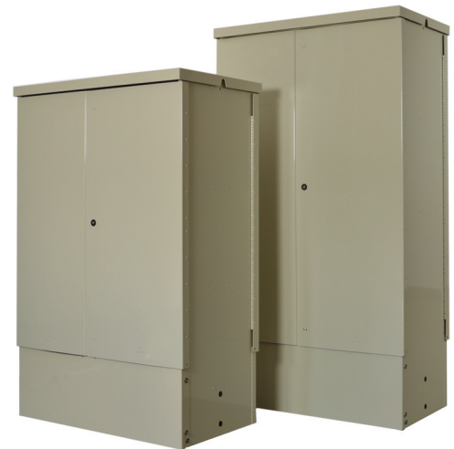
CSE-8000 (left) and CSE-10000 (right). CSE-6000 (not shown) is same height and width as CSE-8000, but 3" less in depth.

CSE are constructed of aluminum and powder coated for long service life. They are designed for pad mounting to a precast concrete pad or Charles advanced composite pad (CPAD), or direct-buried using two 42" mounting stakes. Each enclosure features two sets of doors with 3-point latching for easy access to the cabinet's contents. Configured for copper splice storage, the enclosure features a robust double-sided central mounting flange equipped with two sets of insulated, repositionable ladder bars, cable attachment brackets and multi-position bond plate. A lower removable front panel enables the cabinet to be easily positioned over existing cables and conduits for new or rehabilitation situations.