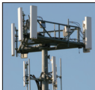
Cell Sites / FTTA