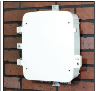
Metal front swing door with four mounting locations for attaching CFIT-Flex Compact Enclosure