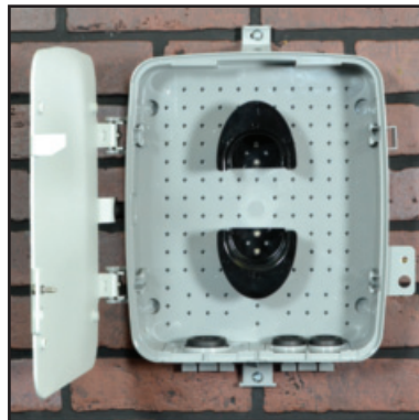
CFIT-Flex Cable Storage Enclosure, with internal cable spool and bottom port plates

The CFIT-Flex Compact Universal Enclosure provides a flexible, multi-functional solution for fiber demarcation requirements within virtually any application. Often during deployment there is an excess of feed cable that needs to be stored. For such cases the CFIT-Flex Cable Storage enclosure provides the solution. It can be quickly and easily mounted behind a CFIT-Flex Compact enclosure to provide efficient cable storage without using any additional real estate. Mounted cable spools and removable entry/exit port plates facilitate storage and access.