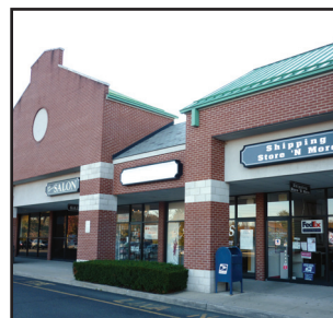
Strip Malls / FTTB